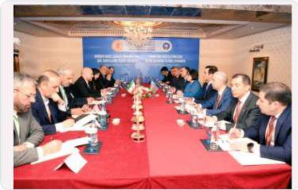
APA Informasiya Agentliyi 9:02 PM - Jan 9, 2023 - 166 Views

Azerbaijan Emb. in Iran @AzEmblran #Azerbaijani, #Iranian Parliament speakers met apa.az/en/foreign-pol...